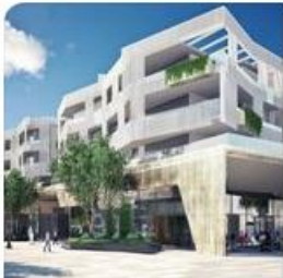
Aveo backs village plan